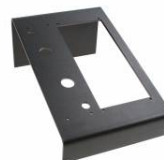
DUAL DESK STAND CRM-V